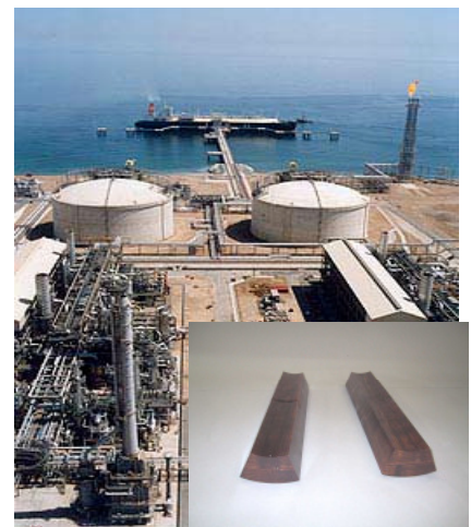
dehonit® at Oman LNG

Our application engineers will be pleased to advise you. Please do not hesitate to contact us. Detailed technical data upon request.