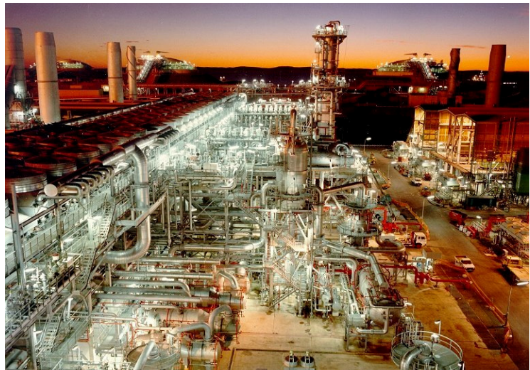
dehonit® at woodside LNG

Deutsche Holzveredlung oHG is one of the world's largest producers of laminated compressed wood, which is sold under the brand names of dehonit®. With over 50 years of manufacturing experience we offer a comprehensive range of products for the cryogenic market.